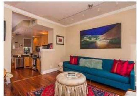
1252½ Riverside Ave, Federal Hill $364,900 3Bed/2Bath