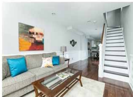
131 W Randall St, Federal Hill $257,500 2Bed/2Bath