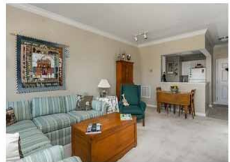
23 Pierside Dr #305, Pierside at Harborview $179,900 1Bed/1Bath