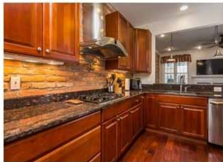
1328 Decatur St, Locust Point $484,900 4Bed/3.5Bath